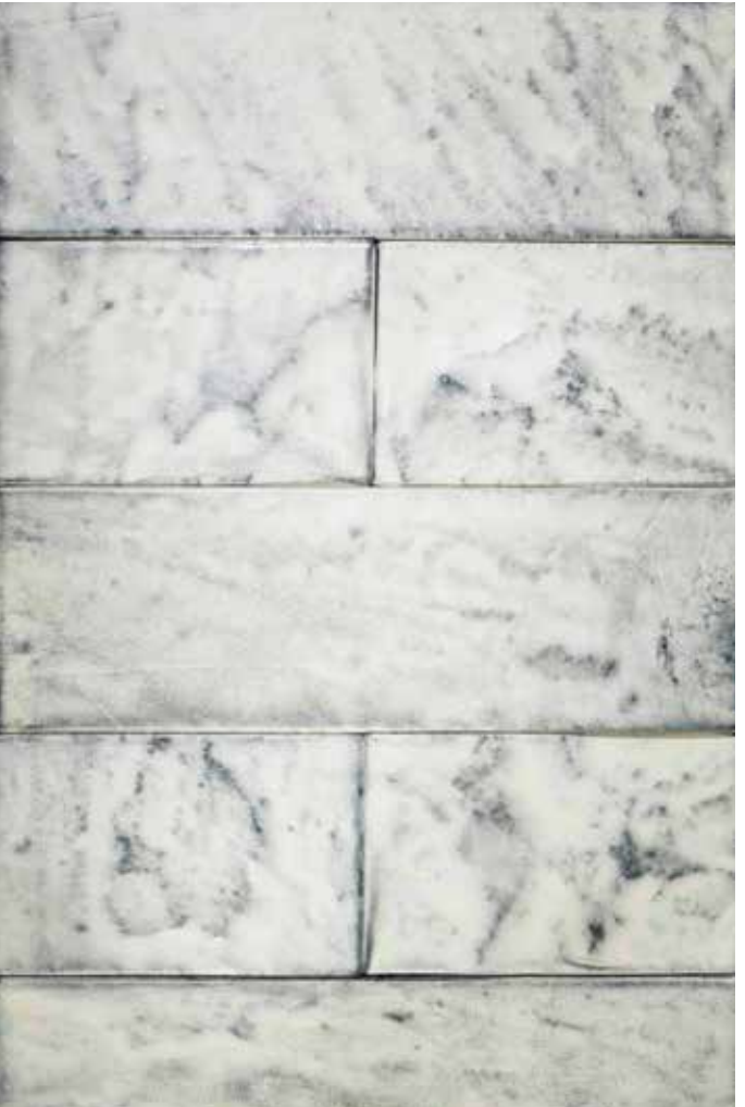
4x24 Planks | Smokestack