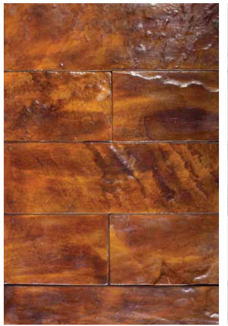
4x24 Planks | Smoky Brown

The stunning fusion of genuine leather and natural stone creates the unique LeatherStone tiles and wall compositions. Natural stone tiles are clad with exquisitely finished imported leather, through a patented process, to give you a plush and luxurious surface. LeatherStone is fabricated in three outstanding design formats in wall compositions: Planks, Opus and Ledge.