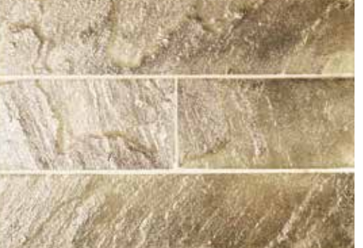
3x12 Tiles | Ivory