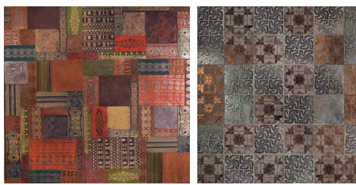
Quilt Patch Format | Elegant

The Tijara Series represents a stunning collection of finely crafted embossed patterns on leather tiles, taking inspiration from the traditional design work of medieval artisans and blending it into a modern \xi chic leather cladding surface. Presented in an innovative combination of leather colors, leather finishes, and artistic motifs, the Tijara Series creates a breathtaking feature for your home of office.